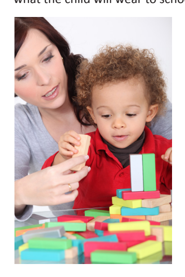
"The smallest moments can have the biggest impact on a child's life." — Author unknown

Legal decision-making, which used to be called legal custody, is the right to make significant, nonemergency decisions for the child, including decisions about education, health care, religious training and personal care. It does not include the routine decisions you will need to make while the child is with you, such as what the child will eat for dinner, which bedtime story to read, which movie or television show the child will watch, or what the child will wear to school.