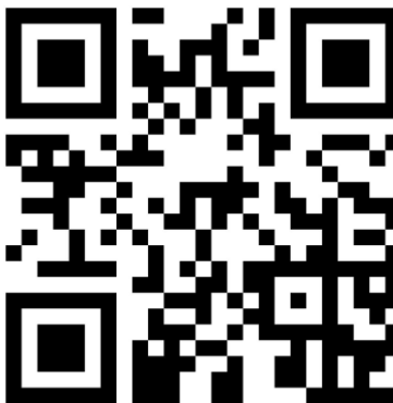
QR Code to AzEIP Website